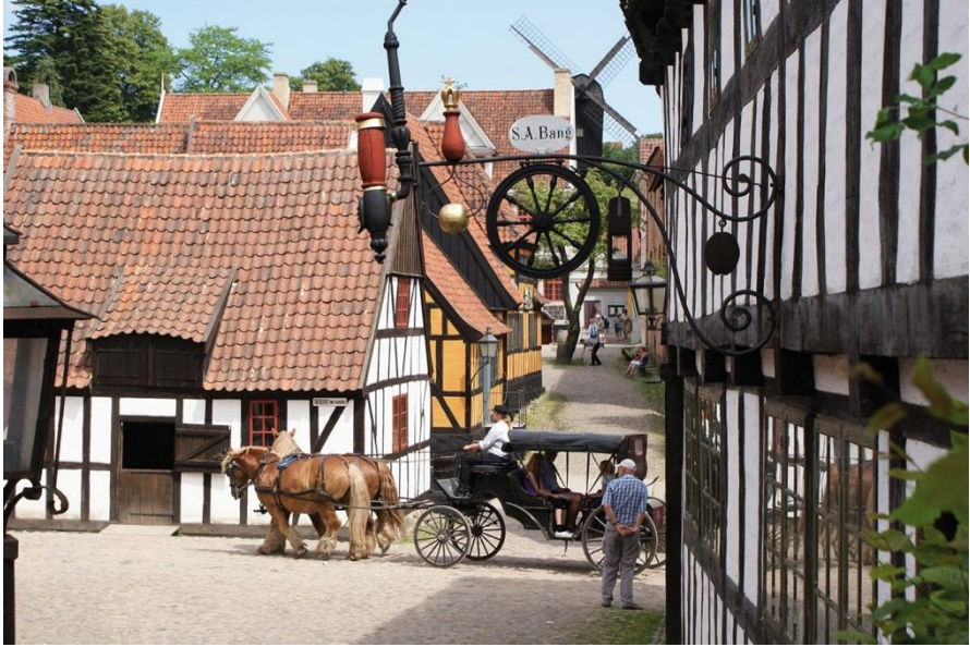
Den Gamle By "The Old Town" Open-Air museum